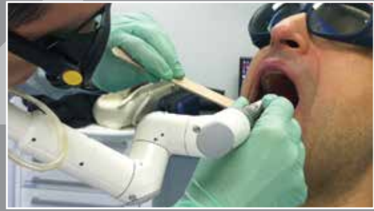
Step 2: TISSUE STRENGTHENING