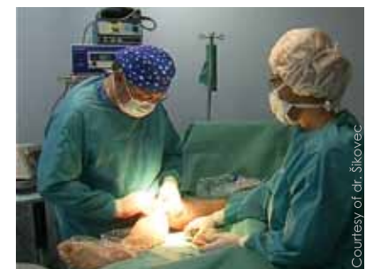
Fig. 3: Fotona's EVLA Tx have exceptional success rates and shorter recovery times

all treatment parameters on one screen. At the touch of a button, the laser system accommodates laser parameters to the application, providing unrivalled convenience.